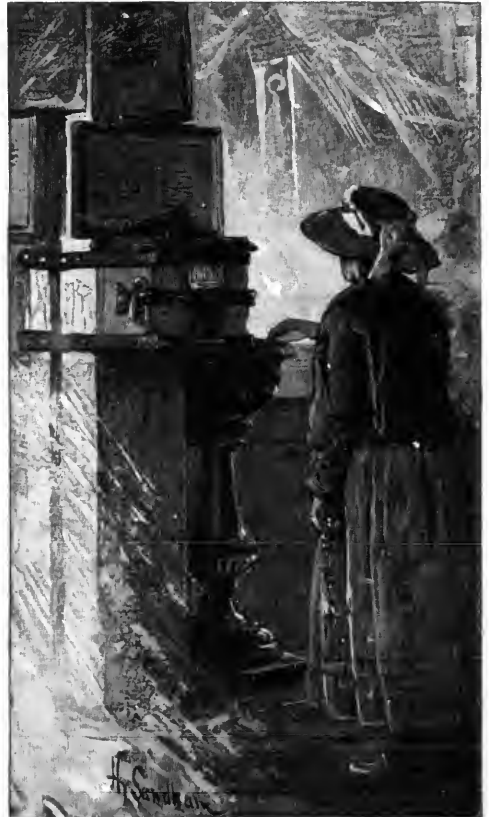
HOLY-WATER FOUNT AND POOR-BOX.

out any such intercession is familiar to every student, and is no doubt an undeveloped branch of medical science. A coincidence is not a miracle, neither is this power of the will over the body a miracle. Among the long list of reputed miracles, the following from a manual of devotion will be sufficiently suggestive: "In the year 1664, a woman broke her leg. As the bone was fractured in four places, it was impossible to set it. For eight months she was unable to walk, and the doctors gave up all hope of a cure. She made a novena , in honor of the saint, and vowed that if she was cured she would visit the shrine every year. She was carried to the church, and during the communion she put aside her crutches and was cured at once." Sworn testimony is given as to instant recovery in diseases said by physicians to be incurable by ordinary means, and among the particular favors accorded to the parish, the temporal as well as spiritual is not forgotten. The Bishop of Montreal says that it is Ste. Anne who obtains for it "rain in the time of drought." "For it is a pious tradition among you," says he, "that a little picture representing Ste. Anne, with her august